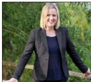
The ever popular JoJo Moyes