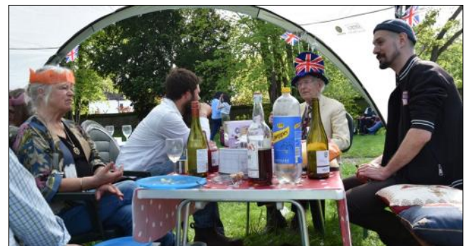
The Coronation was celebrated in fine style...