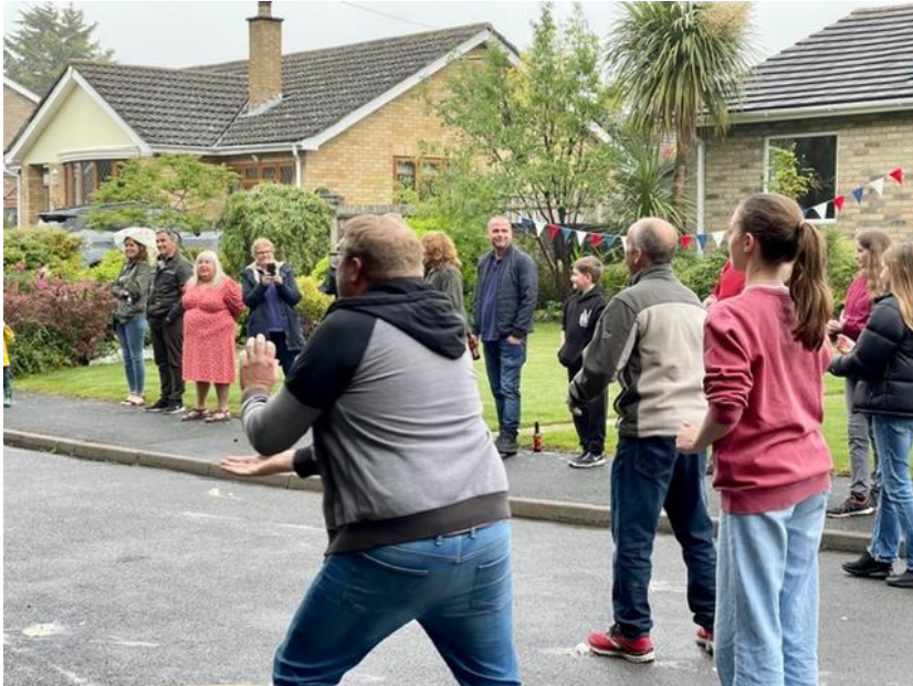
Egg throwing at the Jubilee Picnic