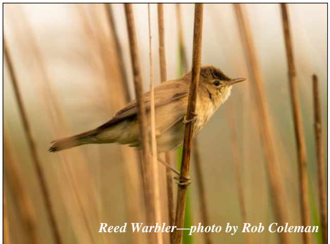
Reed Warbler

Join us for an Easter adventure in nature at Wicken Fen. Discover our family-friendly trail with fun activities for you to do along the way. Complete the trail and earn your Rainforest Alliance chocolate egg at the