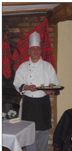
Burn's Night at the Lion