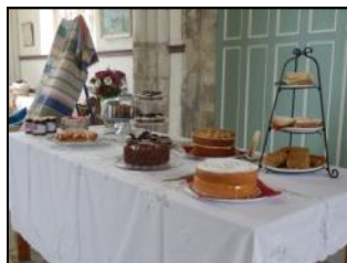
Midsummer Tea Party in waiting