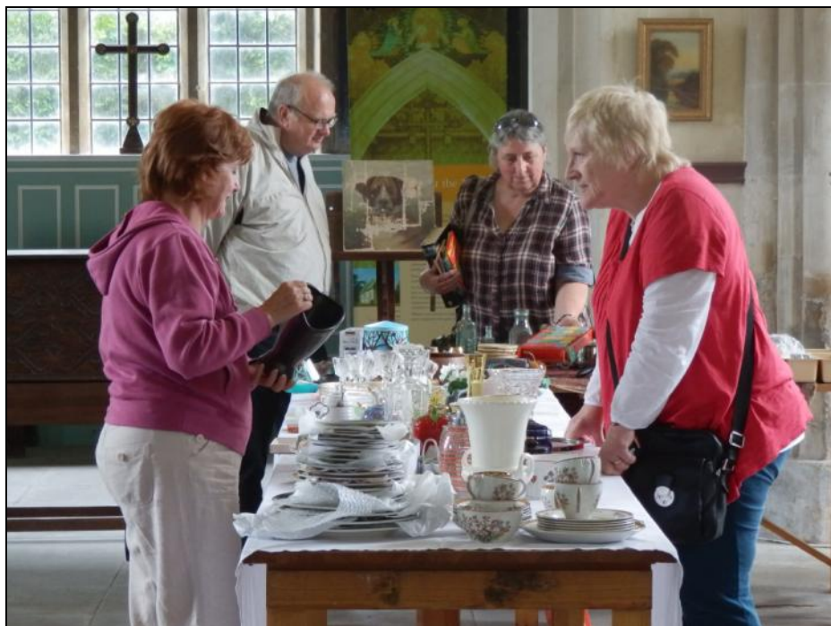
Hard bargaining at the Midsummer Tea-Party