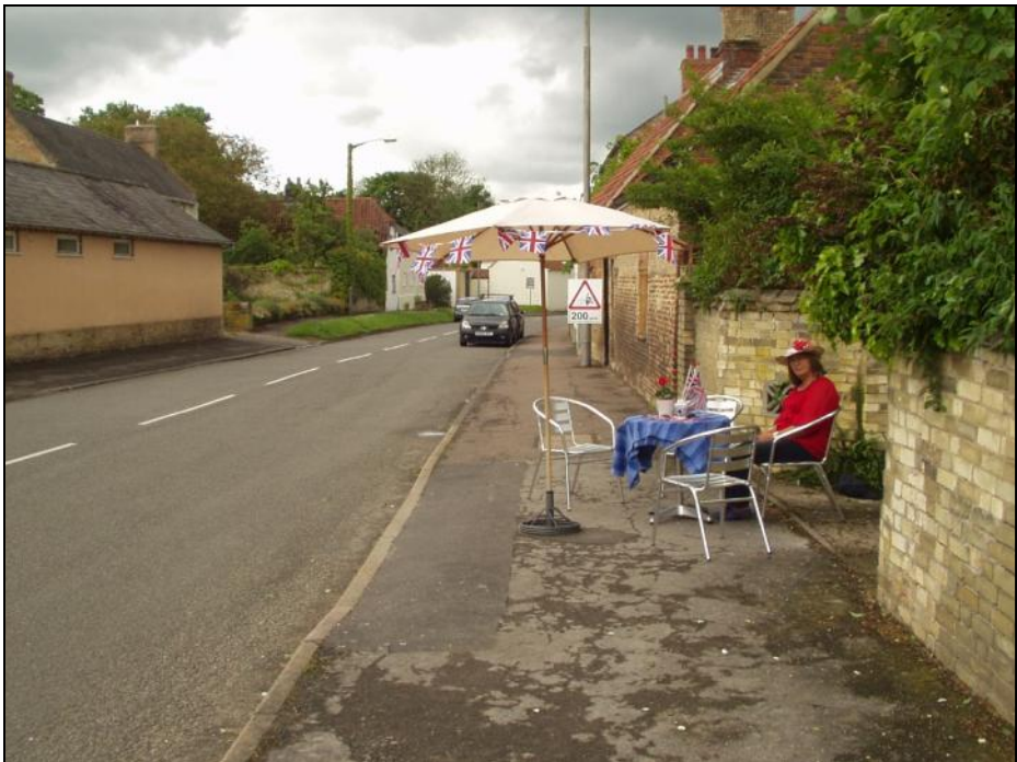
Swaffham Prior 2012 Jubilee Street Party

Oh, the perilous youth we baby-boomers nevertheless survived. I suppose we should be grateful RoSPA didn't ban the even more dangerous swings. Eds.