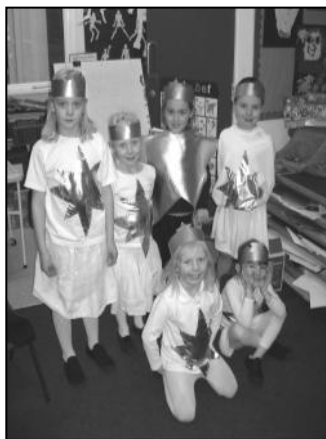
The Gigantic Star and the other Stars.

to make a very sad decision this year to close our outdoor swimming pool, as the repair bill was going to be so huge. However, we feel that the pool is such a valuable resource for the school and the