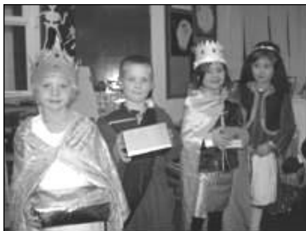
The Three Wise Men

local community that we are retying to raise the money for a new one. It is not going to be cheap, somewhere in the region of £25,000. We are looking for any local businesses who would be willing to make a donation towards the cost of a new pool, or any ideas you may have for fundraising. The pool really does serve our children and families well, if you feel you can help in any way, please contact me on 01638 741529.