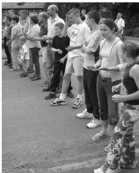
and eggs are thrown .... and dropped!