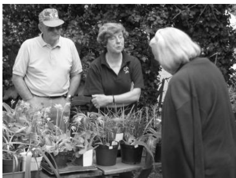
gardeners are made an offer they can't refuse