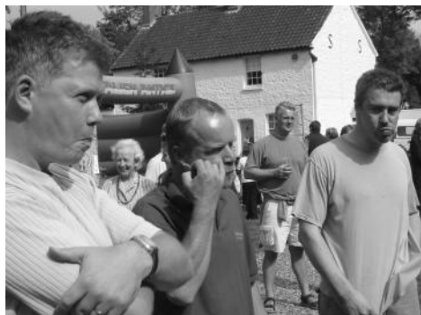
biscuits are eaten