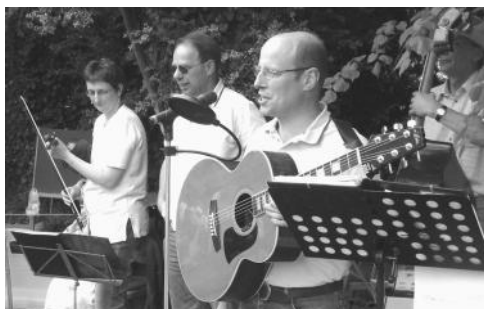
as the band plays on