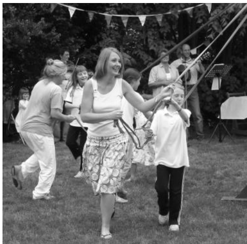
The School's top class show their skills