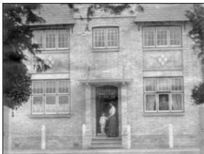
Last week's picture from the Cambridge Collection showed the New Cock public house in Swaffham Prior taken around 1910. Outside the building is Mrs Milgate, wife of the then licensee.